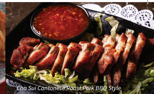
Cha Sui Cantonese Roast Pork BBQ Style