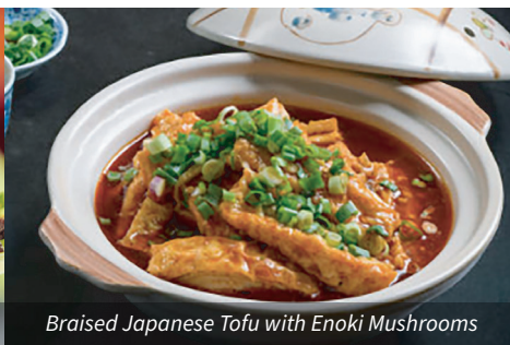
Braised Japanese Tofu with Enoki Mushrooms