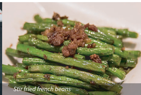
Stir fried french beans