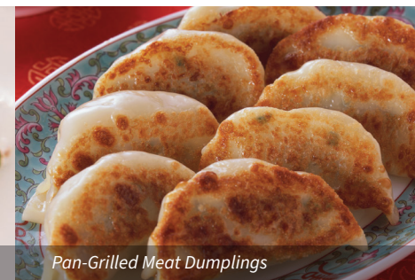
Pan-Grilled Meat Dumplings