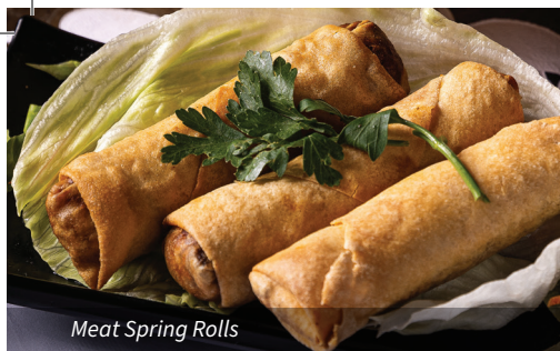
Meat Spring Rolls