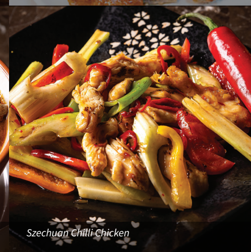
Szechuan Chilli Chicken

Important Customer Notice: our restaurant may contain some or all of the following ingredients: Cereal/Wheat flour (containing gluten), Egg, Fish (fish sauce), Soybeans, Peanut, Milk, Nut (almonds, hazelnuts, walnuts, cashew nuts, seeds), Celery, Mustard, Sesame, Lupin, Sulphur dioxide (preservative vegetable, dried fruit), Crustaceans (prawns, crab, lobster & crayfish), Molluscs (clams, mussels, oyster, squid, octopus), Oil (peanut oil, sunflower oil, sesame oil).