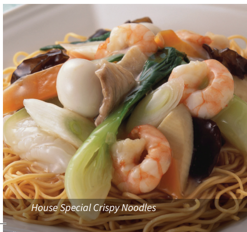
House Special Crispy Noodles